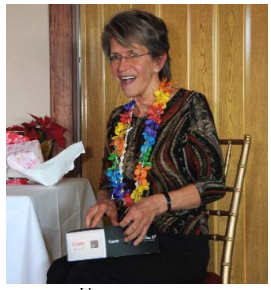
It's a camera.